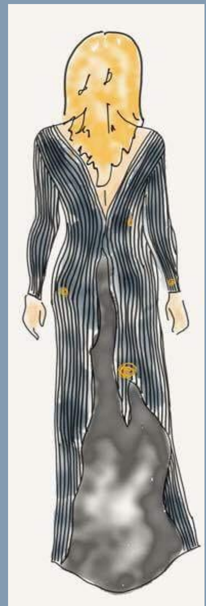
Back of the dress