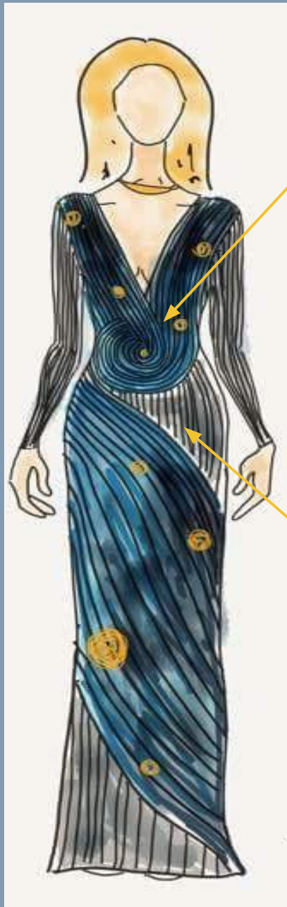
Front of the dress